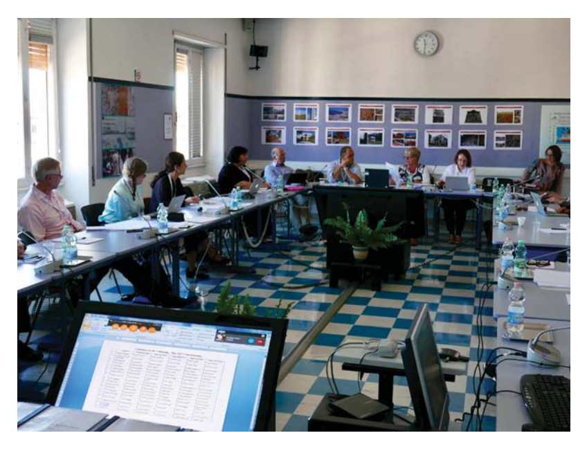
IIC Council at work in the ICCROM offices, May 2017.