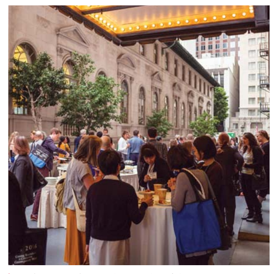
Delegates relaxing during a break between sessions at the Los Angeles Congress.

collection, always an interesting and pleasurable experience. The visits to conservation studios, galleries and fabricators and walks through the city, arranged as part of the technical programme, were just as enjoyable.