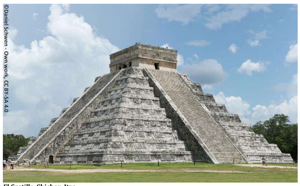
El Castillo, Chichen-Itza

MEXICO - A multidisciplinary group of scientists from the National Autonomous University of Mexico (UNAM) and the National Institute of Anthropology and History (INAH), has confirmed the existence of a second substructure located inside the Kukulkan pyramid also known as el Castillo in the archaeological site of Chichén-Itzá in Mexico. The structure was built between 550 and 800 AD, during the earliest and least known stage of this Mayan settlement.