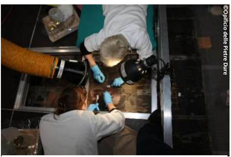
Conservators from the Opificio delle Pietre Dure at work on The Last Supper

The work was carried out by conservators from the Opificio delle Pietre Dure (News in Conservation, Issue 40, February 2014), a