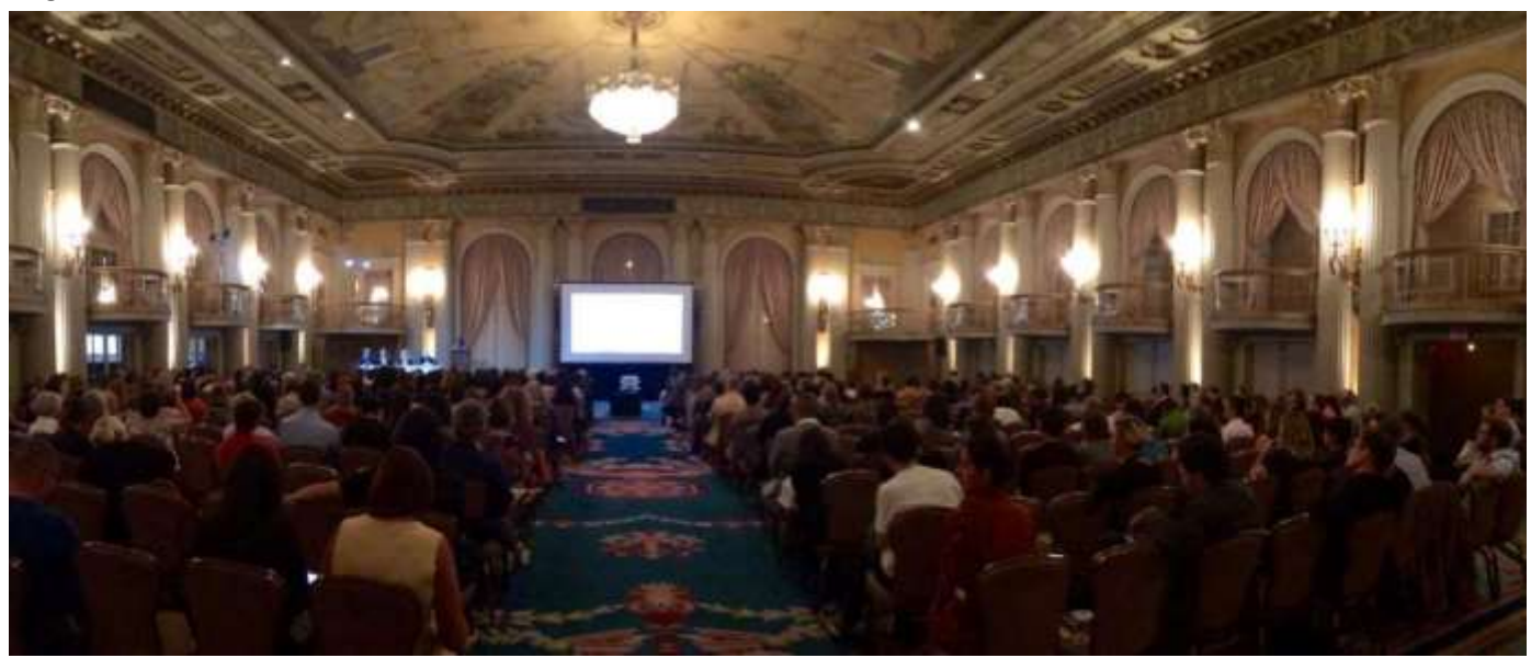
A packed session at the 2016 IIC Congress

IIC Council meets three times a year, generally for two days. However every two years we coincide our meetings with the IIC Biennial Congress, and meet for only one day prior to the Congress. So this year saw us meet on Sunday 11<sup>th</sup> September in the grand surroundings of the Roman Room at the historic Biltmore Hotel in downtown Los Angeles.