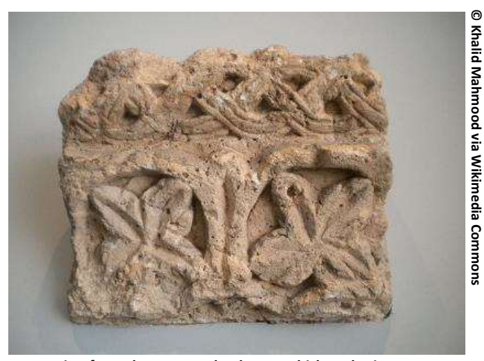
Decoration from the Umayyad Palace at Khirbat ul Minya

Led by PD Dr Hans-Peter Kuhnen of the Department of Ancient Studies at JGU, the team is hoping to find out how the site looked before the palace was built and whether the building was used for different purposes after the catastrophic earthquake of 749 AD. The palace, which was still under construction at the time, suffered major damage during the quake. Findings from the new excavations show that the building lost its palatial function as a result of the earthquake and was