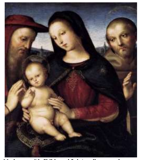
Madonna with Childs and Saints, oil on panel, 1502

In addition to the excavations, a conservation project is also taking place with financial support from the Cultural Preservation Programme of the German Federal Foreign Office. The objective is to prevent further deterioration of the ruins. Mainz University has commissioned a German-Israeli restoration team to carry out reinforcement work to consolidate the structures most at risk of collapsing. In preparation for the job, the Laboratory for Building Research at the Rhein Main University of Applied Sciences in Wiesbaden has begun a new and precise survey of the structures in order to get a clear idea of their construction technique as well as to ensure optimal planning for the type and scope of the upcoming restoration work.