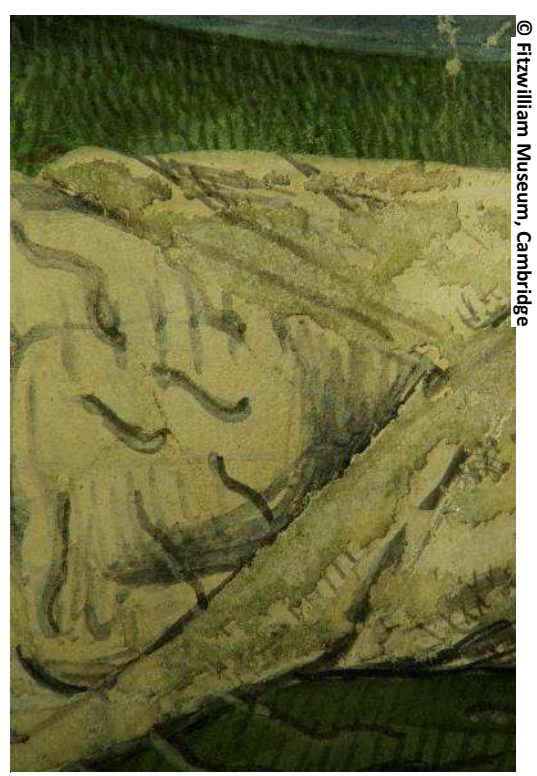
Flaking white pigment in MS 164 is consolidated to prevent further losses but not retouched, allowing the under-drawing to be studied

Book conservators dealing with this sort of problem are faced with stark challenges: is it better to preserve a fairly common, mechanically inadequate, old but non-original binding at the expense of being able to study the hugely more significant manuscript it contains; or to