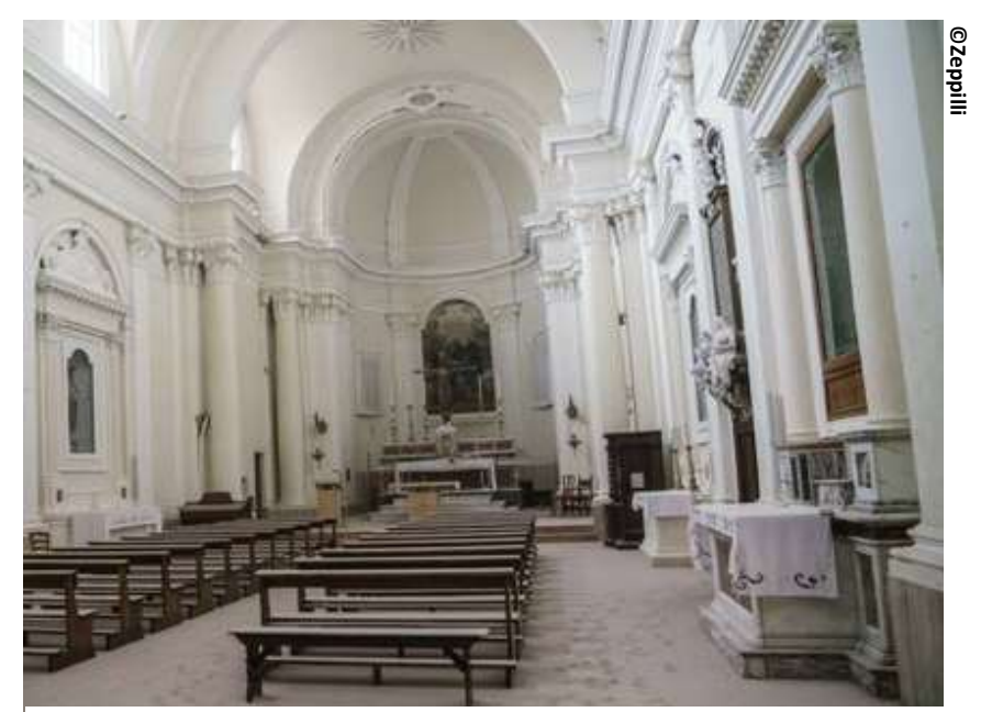
Inside the Church of St. Francis in Amandola

ITALY – A team of Japanese experts from the Architectural Institute of Japan has carried out a survey in October 2016, following a series of devastating earthquakes in Central Italy.