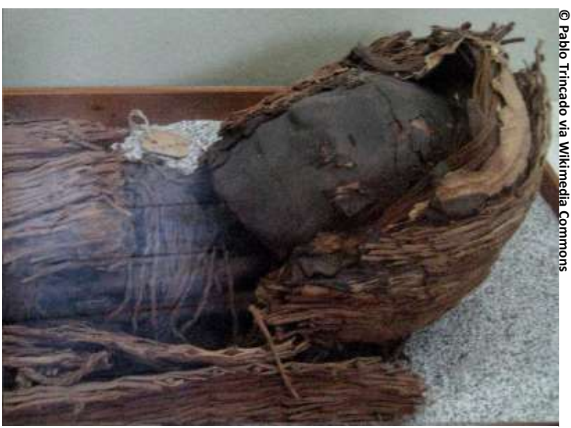
Head of a mummy from the Chinchorro culture, found in Northern Chile

Local officials have applied to UNESCO to have the collection recognised as a world heritage site which could be the first step in