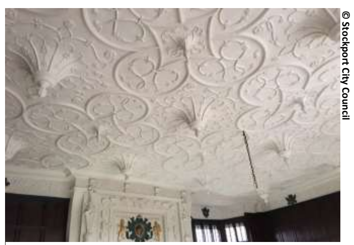
Bramall Hall's Withdrawing Room Ceiling

Work on the delicate project to stabilise and repair the decorative, Venetian ceiling in the Withdrawing Room began 12 months ago. Stockport Council appointed Hirst Conservation to undertake this work, which involved removing cracked, modern paint, conserving plasterwork and re-decoration in authentic colours based on historic paint analysis.