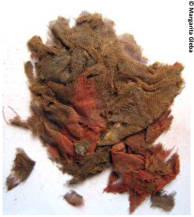
Fine open tabby of silk sample with irregular red colour

The cloth remains are of further significance as very few contemporary textile finds are known from Nepal. The dry climate and high altitude of the Samdzong tomb complex, at an elevation of 4000 m, favoured the exceptional preservation of these organic materials.