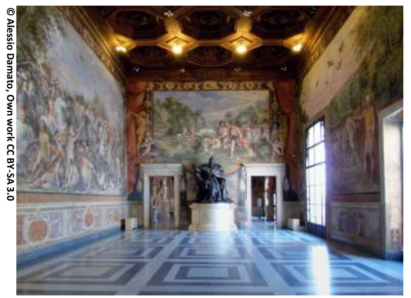
The Orazi and Curazi room, Musei Capitolini, Rome