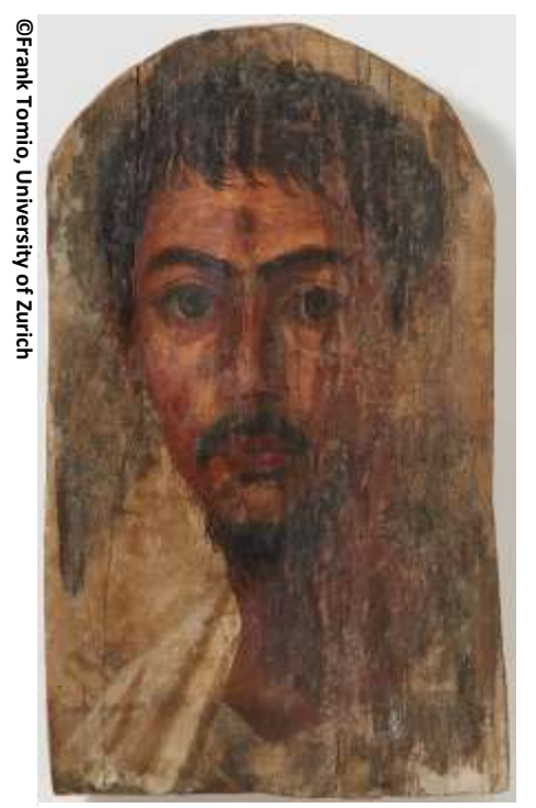
Mummy portrait of a young man