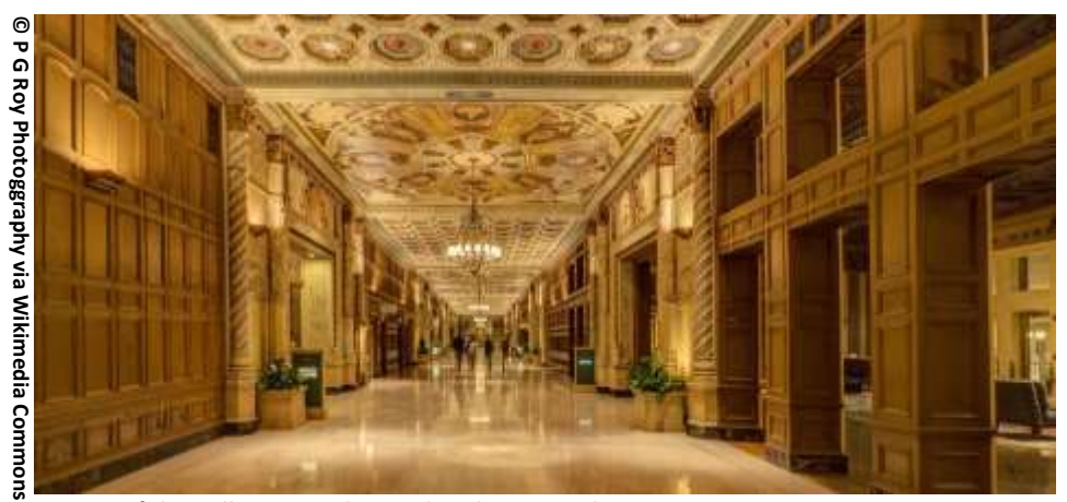
Interior of the Millennium Biltmore hotel, Los Angeles

Los Angeles County Museum of Art (LACMA) as well as at the Congress venue, the historic and elegant Millennium Biltmore Hotel.