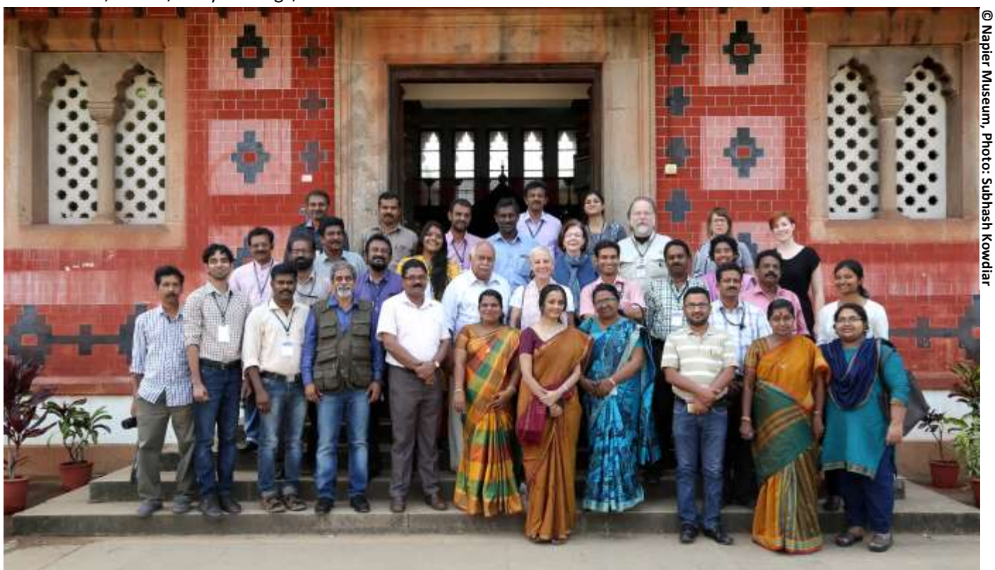
Workshop team with participants and museum personnel at the Napier Museum

In 1880, the building began to serve as a museum and was named after Lord Napier. It has been modified various times. The storage, for example, is a later addition. The complex houses as well a Natural History Museum and a Zoological Park. The Napier Museum today exhibits more than 550 objects. The major collections include metal sculptures from the 8th to 18th century AD. The art is inspired by the existing religious faiths. The guidelines for iconographic details and bronze casting of these works are taken from the traditional texts of 'Silpashastras' and 'Matsyapurana' respectively. The collection is also rich in stone objects, e.g. the 2nd century 'Gandhara' to the 18th century Kerala sculptures, depicting influences of Chera, Chola, Pallava, Pandya and Vijayanagara empires. Carvings in kumble wood form an integral part of the collection. In addition, the museum is endowed with musical instruments, masks, ivory carvings, ancient coins and textiles.