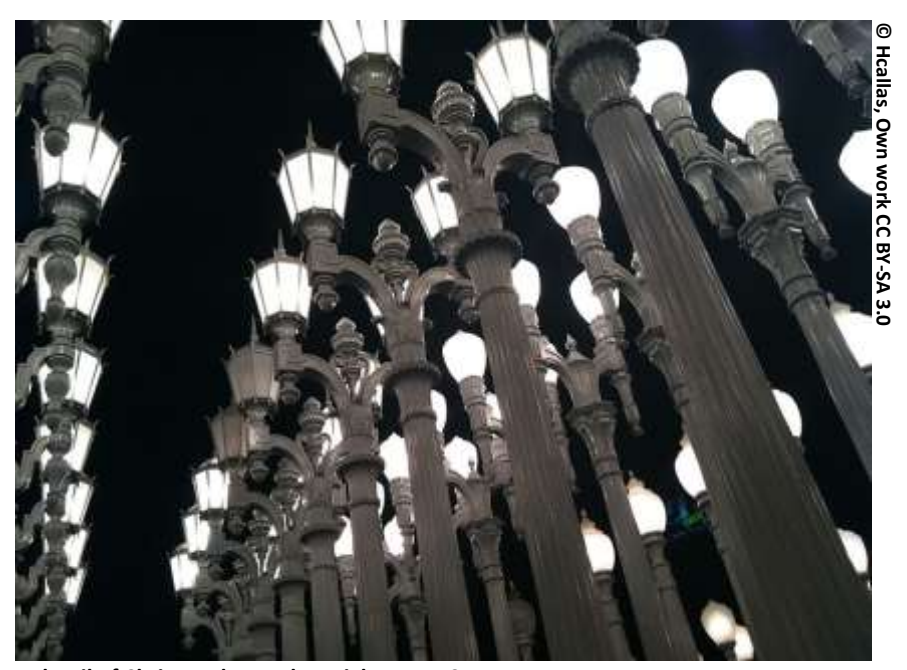
A detail of Chris Burdens Urban Lights at LACMA

LOS ANGELES – When the Los Angeles County Museum of Art first announced the closure of Chris Burden's light installation Urban Lights to undergo restoration there was an unexpectedly strong public reaction to the news. This prompted LACMA to reconsider its decision and it has now been confirmed that the installation will only be switched off partially, allowing continued access for the public to at least half the site.