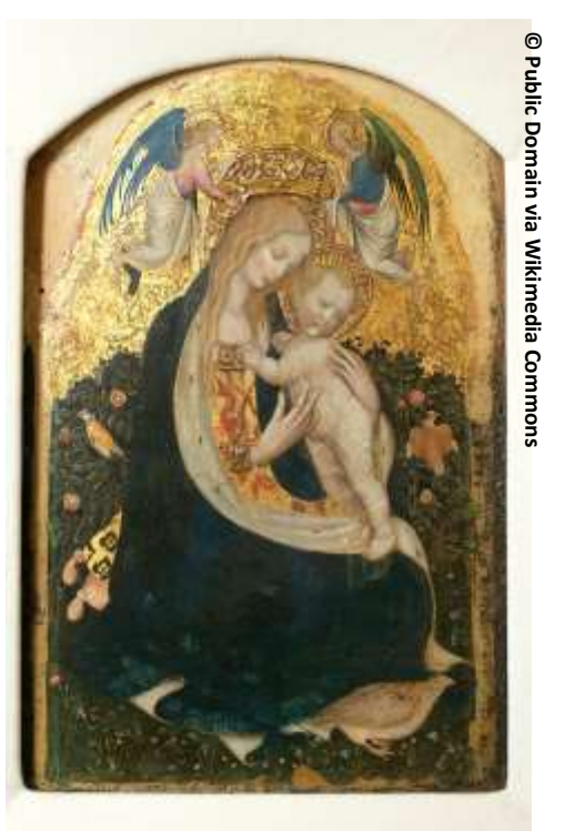
Madonna della Qualia, Pisanello c.1420, previously at Castelvecchio Museum

The Mayor of Verona, Flavio Tosi, thanked the team of the Heritage Protection Unit who settled the case through international collaboration. He said: "We are breathing an enormous sigh of relief and we are very happy because it is an important piece of Verona that is to be returned to the citizens of the city and the whole world."