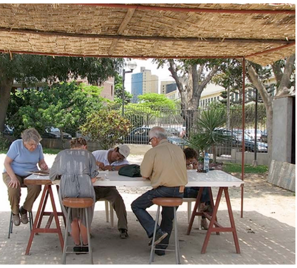
Students working on textiles at the Huaca Malena Museum in Asia, Peru