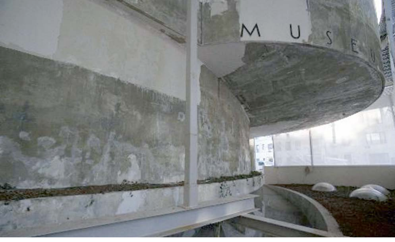
The distinctive and iconic exterior of Frank Lloyd Wright's building