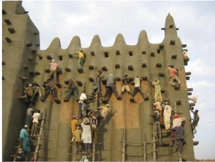
Ceremonial repair of the temple at Djenné

ASC: I agree. And you cite in your publication the Djenné mosque in Mali It is a mud brick structure and the people gather together when it needs re-mudding; it's a ritual activity that results in preservation and continuity. That act doesn't need conservators...that act needs the community.