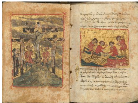
Photo: Gospel of Mark. Special Collections Research Center, University of Chicago Library, Ms. 972.