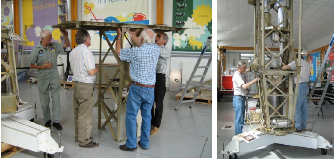
The original project engineers from Birmingham University join the conservation team in 2006 to repair, reconstruct, and clean the XRT- X-ray space telescope at the Science Museum in London.