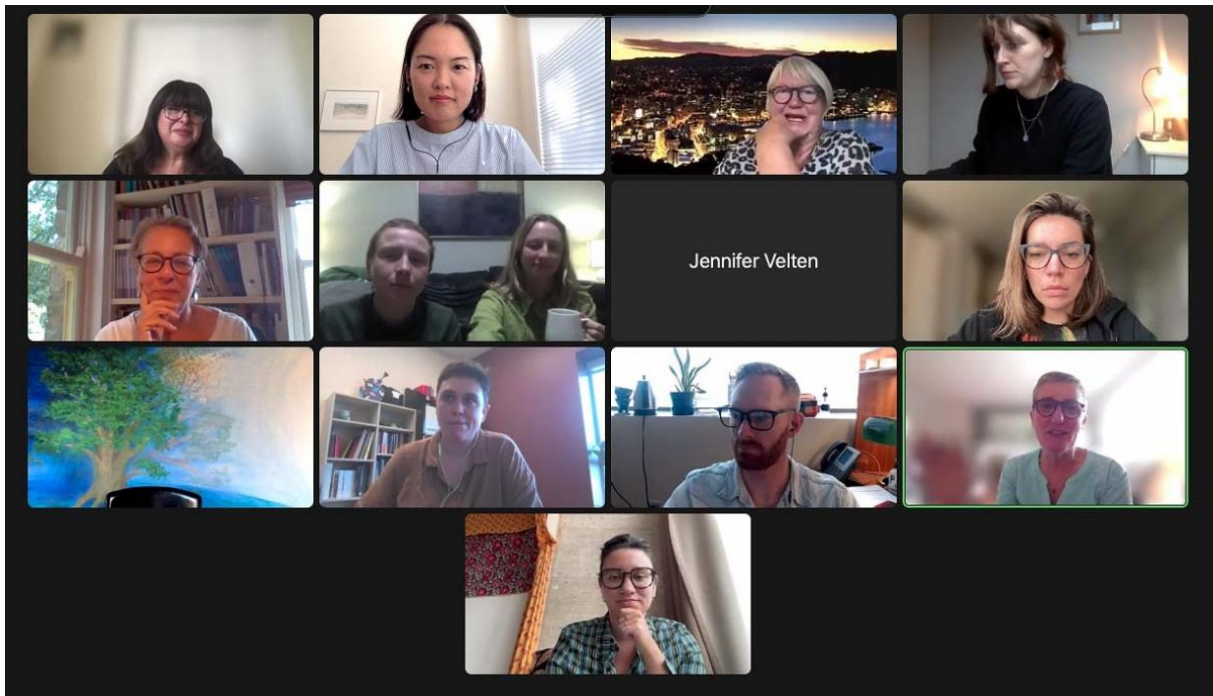
Screenshot of session co-chairs, DEVs, IIC staff, and presenters during the North America Regional Live Hub Q&A Zoom webinar

his projects, with a view on providing education on the management of archaeological sites so that communities feel a deeper connection to the sites, and thus the beneficial effects of the excavations could last longer.