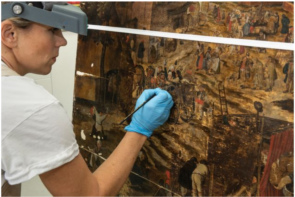
Painting Conservator, Genevieve Silvester working on A Village fair (Village festival in honour of Saint Hubert and Saint Anthony) by Pieter Brueghel the Younger early C16th M1961/1