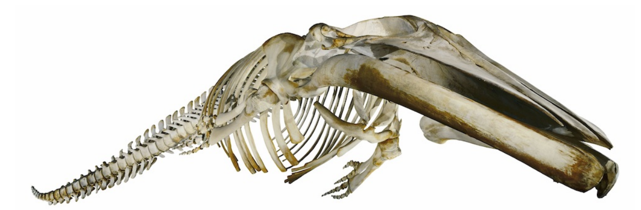
Pygmy Blue Whale, Balaenoptera musculus brevicauda, collected September 1994, Motutapu Island, Hauraki Gulf, New Zealand. Gift of the Department of Conservation (Auckland Conservancy), 1994. CC BY 4.0. Te Papa (MM002191)

Marine Mammals Collection Highlights - Highlights of our collection of marine mammals including whale specimens and the bespoke fabricated steel trolleys that have been constructed for their storage, handling and transit. (20 minutes) Presented by Felix Marx, Curator Vertabrates.