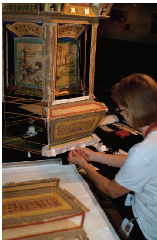
Conservator from the Royal British Columbia Museum, Canada, at work on the Chinese Freemason's Lantern during the Public Conservation Project in 2014.