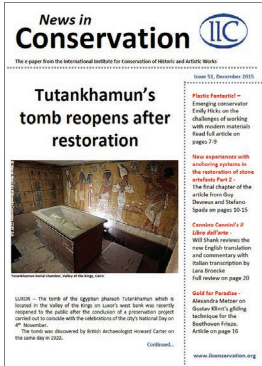
News in Conservation , issue for December 2015

these sites continued to grow, indicating there is an ever increasing interest and demand for informed conservation content.