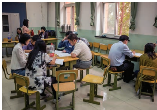
Participants discussing assignments during the course.

large institution, may need advice in a relatively brief, succinct form.