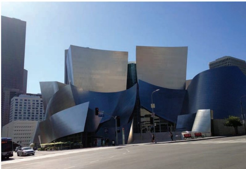
The Walt Disney Concert Hall, Los Angeles, one of the tour options for the Los Angeles Congress.

As in previous years, IIC has been fortunate to receive a generous grant from the Getty Foundation to enable conference attendance for 30 participants from parts of the world where travel to and attendance at such a conference is simply too expensive. The final selection of candidates is agreed by the Getty Foundation. On this occasion, IIC has also received a grant from Tru Vue, partly towards the preprints and partly towards travel and accommodation for five people. IIC's own Brommelle Memorial Fund has also been able to support the attendance of 18 conservation students at the 2016 Congress.