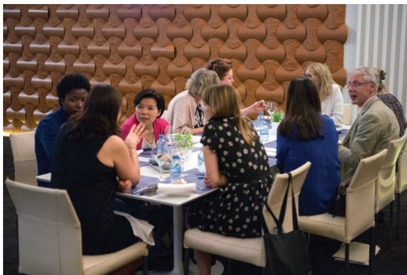
Council members with local conservators and UCL Qatar staff at dinner in Doha.