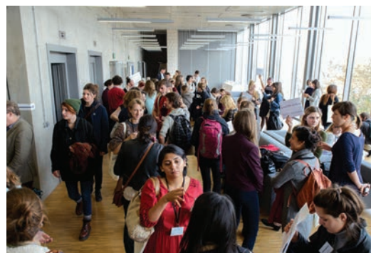
Visit to the Warsaw Academy of Fine Art studio.