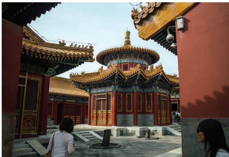
Courtyard in the Palace Museum.

Banded membership rates are planned to be introduced for the 2017-18 membership year, following a classification of countries based on per capita income as used by the International Council of Museums (ICOM). It is hoped that this will make IIC membership more affordable for those in those countries where average incomes are very much lower.