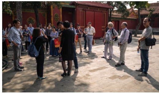
Participants and lecturers touring the Palace Museum buildings.

IIC's new Professional Seminars are intended partly to help with professional development and partly to provide information on matters where a conservation professional, particularly one working privately without the support of a