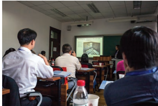
Lecturing on the Preventive Conservation course.