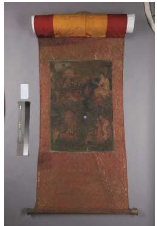
The Tangka before treatment

Since the origin of the two thangkas is unknown and their iconography differs in the presentation of composition, but they are framed the same way, two major questions arose: where did they