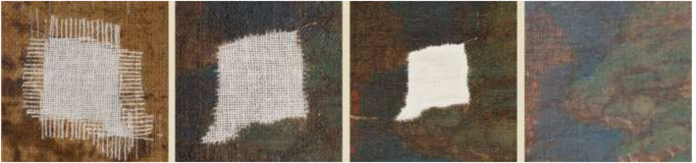
Phases of the repairs

losing its function as a scroll painting. Furthermore, a new method for the hanging should be developed to ensure that the main weight of the lower rods would be carried by supporting construction.