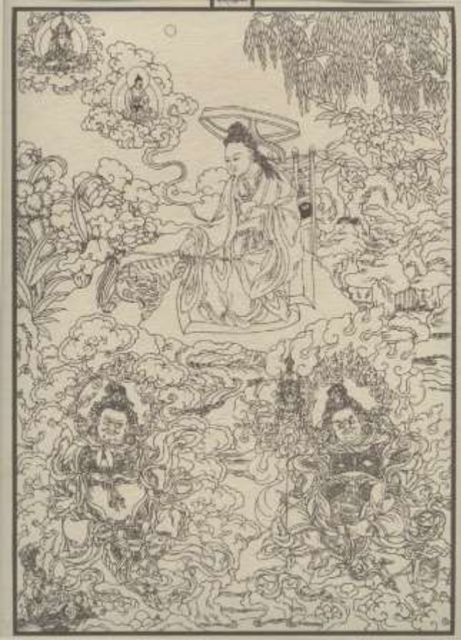
A block print used for comparison

originate? Are the two paintings just framed the same way or part of a bigger ensemble?