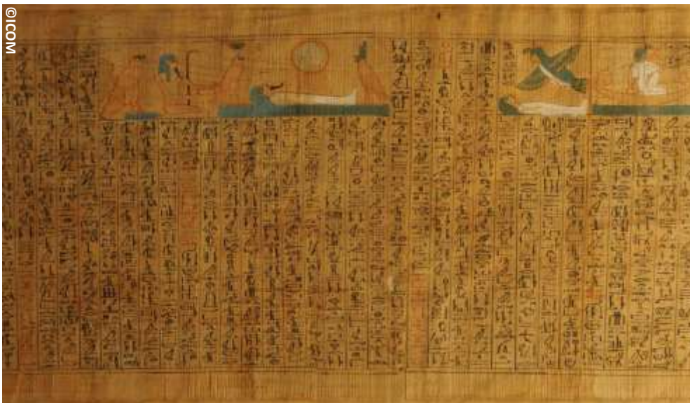
Illustrated religious or ceremonial text at risk of being trafficked, featured on the ICOM Red List

LONDON - The question that many have been asking following the recent well documented destructions and acts of vandalism on cultural heritage is whether the trafficking in antiquities pillaged from the Middle East and North Africa regions is providing funding for insurgent groups active in conflict areas.