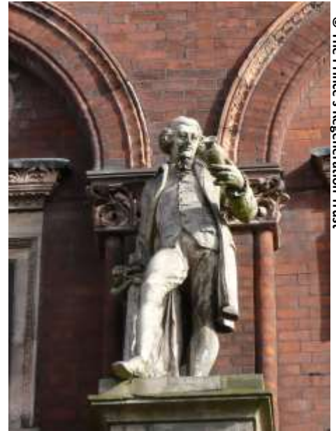
Detail, Burslem, April 2008

To learn more about their work visit: http://www.princes-regeneration.org/