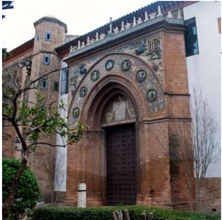
Niculoso Pisano Portal, Seville

The project will start this year and will be implemented by the Instituto Andaluz de Patrimonio Histórico IAPH. For more information about this project visit: http://www.wmf.org/project/monastery-santa-paula