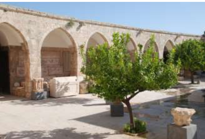
Ma'arra Mosaic Museum

ALEPPO - Syria's renowned Ma'arra Mosaic Museum, significantly damaged and in danger of collapsing as a result of the country's ongoing civil war, has undergone emergency conservation carried out by Syrian cultural heritage professionals and volunteers. Housing one of the most important collections of 3rd to 6th century Roman and Byzantine mosaics in the Middle East, the Ma'arra Mosaic Museum is located about 50 miles south of Aleppo. The Museum was an old caravanserai , or roadside inn, that was constructed in 1595 and refurbished as a museum in 1987.