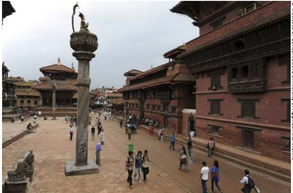
The Durbar Square of Patan with the façade of the Royal Palace and one of the Gates

For more information about this project visit: http://www.kvptnepal.org/