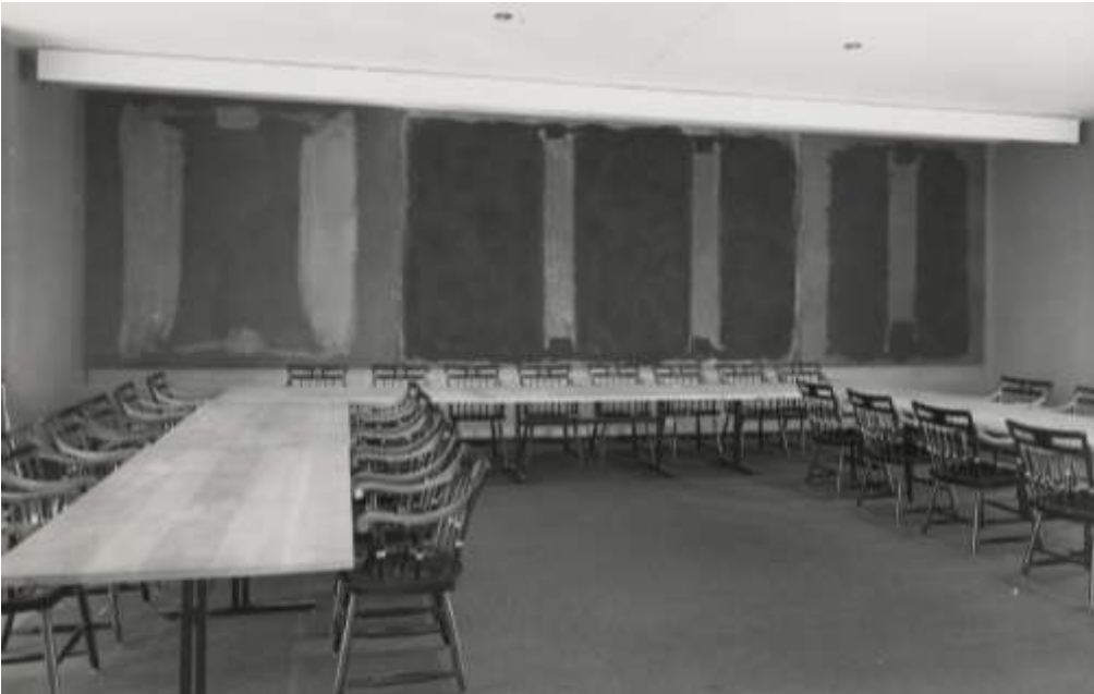
Panel One, Panel Two and Panel Three, 1965

The digital conservation approach used on the works employs specially calibrated light as a tool to restore the appearance of the mural's original colours, which had faded during the 1960s and 1970s when the five large-scale canvas paintings were on display in a penthouse dining room at Harvard University. High levels of natural light coming through the floor-to-ceiling windows ultimately caused Rothko's colours to fade, and the five paintings showed differing patterns of colour loss.