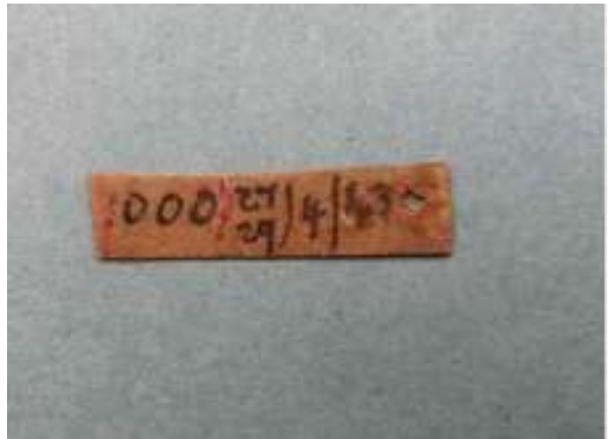
The pins visible from the verso of the map and one of the labels

Choosing the first option would imply that the fundamental causes of the gradual deterioration would remain. The benefit of the second option was the stabilisation of the item as a whole. Prioritising long-term preservation was clearly the route by which to proceed. However, the removal of the 679 labels would be a considerably more time-consuming treatment compared to the first option.