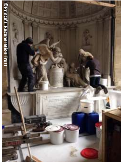
Cleaning the monument to Lady Mary Duchess of Montagu, 1775

WARKTON - Work has started to restore Warkton's hidden treasure, the Montagu Monuments, thanks to a Heritage Lottery Fund (HLF) grant of £318k towards the £489k project. The Montagu Monuments are significant 18th century memorial sculptures in the Grade I listed St Edmund's Church in Warkton, UK and include four marble memorial sculptures of international importance, which draw visitors from all over the world. Two of the monuments were created by French sculptor Louis-François Roubiliac and are considered to be surpassed only by his monument to Lady Elizabeth Nightingale at Westminster Abbey in London.