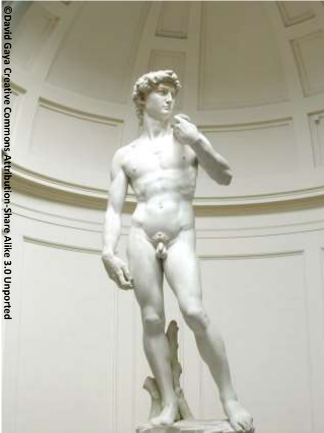
The statue of David in its current location in the Galleria dell'Accademia in Florence

FLORENCE – A new study published in the Journal of Cultural Heritage argues that Michelangelo's statue of David is at risk of toppling under its own weight.