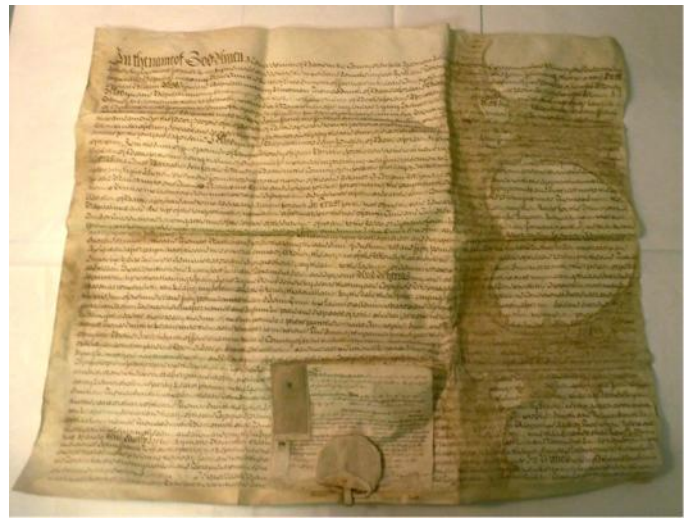
Parchment Will, unfolded after some gentle humidification

The accreditation scheme for museums, administered by ACE, provides, among other things, a framework for Collection Care policies and plans. However, maintaining the accreditation status for a museum requires time and energy even considering the support of a committed team of ACE Museum Development Officers. All in all, museum staff and volunteers, spend a lot of their time managing the day-to-day activities required to run their museums, regardless of size and complexity, so it is no wonder that conservation can be regarded as a luxury. Indeed, their workload (especially over Christmas – a busy time for some museums) precluded many from even participating in the project, as they could not find time to fill in the initial survey we needed to assess their needs. Those that did, however, had the opportunity to have free conservation work done as part of the project. This was enthusiastically embraced as even small conservation projects could be beyond the means of some museums.