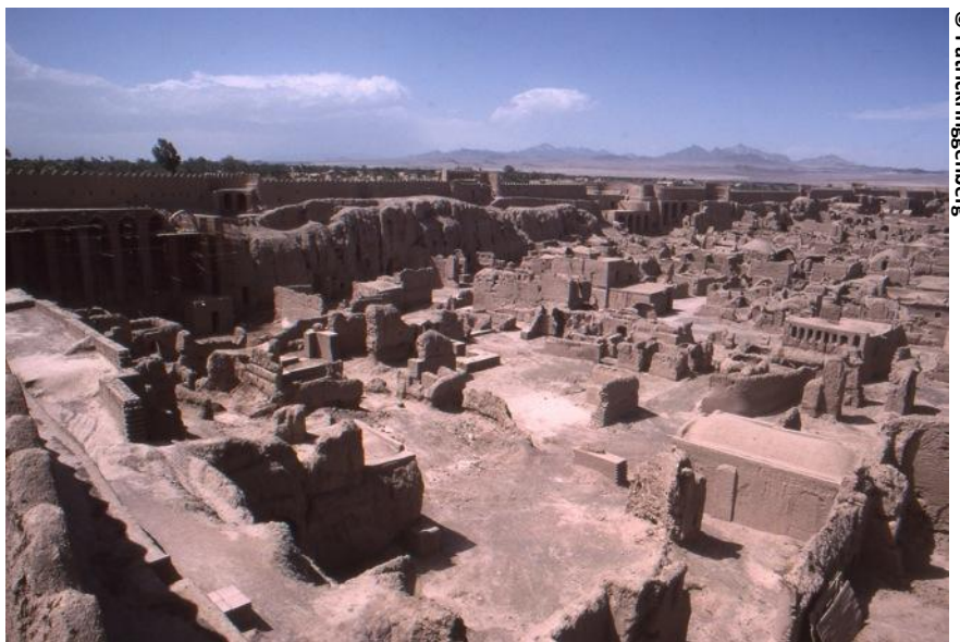
View of Bam Citadel, Iran

A spokesman from UNESCO said in a statement: "The remains of the desert citadel, which reached its apogee from the 7th to 11th centuries, had been sufficiently stabilised and its management was sound enough for the site to be declared safe".