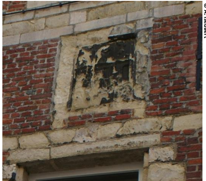
Severely decayed gable stone in bas-relief. Kaasrui, Antwerp, Belgium.

Since natural stone is the main construction material for built heritage, its alteration implies a challenge for conservation institutions. Repair of original stone can be performed with replacement stone but also with repair mortars. In both cases, the replacement material has to be compatible in short-term and long-term, to avoid damage or different alteration. In addition to mineralogical considerations, mortar compatibility can be determined through their properties (mechanical, physical) and their appearance. Creating a durable repair mortar by taking into account these parameters can be achieved through mathematical optimization, since genetic algorithms are suited to solve such a multi-objective problem [1].