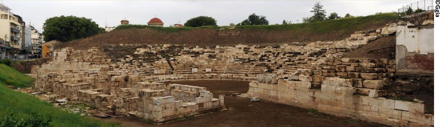
Ancient theater of Larissa, Thessaly, Greece.

ATHENS - About 8,000 archaeological objects dating to the Neolithic age and exported illegally to Germany by a group of foreign archaeologists under the guidance of Alfred Rosenberg, Hitler's chief ideologist, will soon be returned to Greece. The antiquities were illegally excavated in the area of Thessaly, near the town of Velestino, in 1941 during the Second World War.