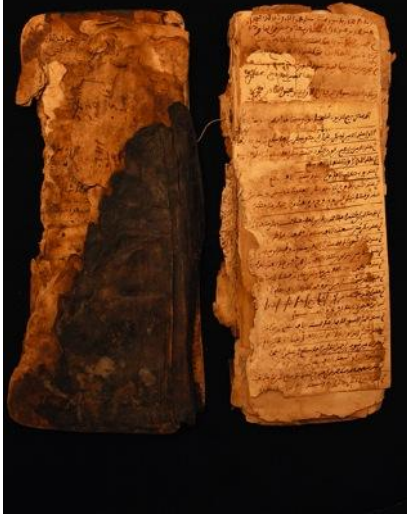
One of the manuscripts from Timbuktu

Timbuktu’s ancient families and it is thanks to their survival that we have been able to piece together the history of a moderate Islam, in which scholars argued for women’s rights and welcomed Christians and Jews.