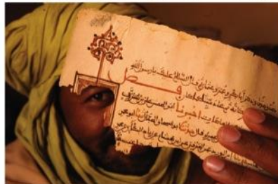
This initiative has undertaken a Herculean task to encase 400,000 medieval manuscripts evacuated from Timbuktu in archival boxes.

Recently forced into exile by the war in northern Mali, these primarily rag and floating ink documents are already showing signs of stress from packing and humidity damage from the difference in climate between their home in Timbuktu and the part of Mali where they are being safeguarded in.