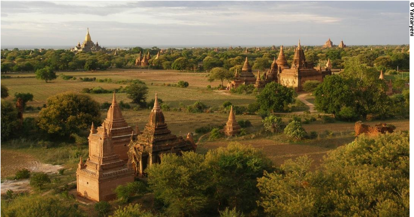
A view of the City of Bagan, Iran

NAYPYDAW – The ancient city of Bagan, Burma (Myanmar), has re-submitted an application to UNESCO to receive World Heritage status. An early bid submitted in 1996, had been refused by UNESCO on the ground that conservation and preservation efforts were carried out with disregard for internationally recognised standards and with restoration interventions being inauthentic and arbitrary.