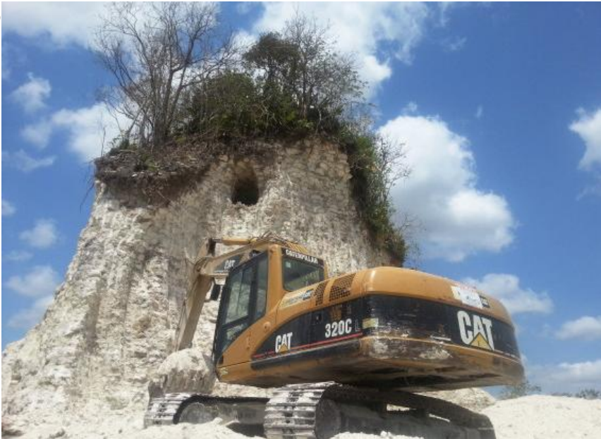
Bulldozer working on the demolition of the pyramid

BELIZE – One of the oldest pyramid structure in Belize has been destroyed to re-use its construction material as road fill.