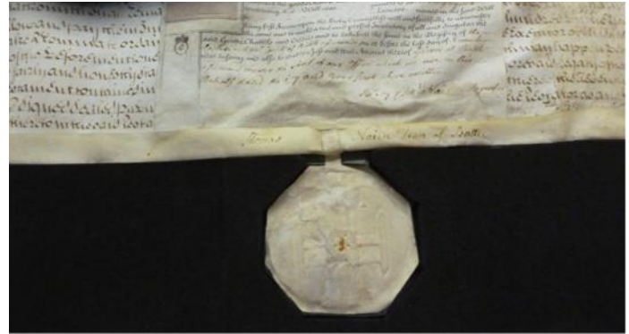
Details of the seal before and after conservation

A specialist parchment conservator was asked to devise a treatment for the will, so it could be displayed and stored flat. She also undertook some conservation and consolidation of the pendant seal, which had begun to degrade in the box due to the lack of support.