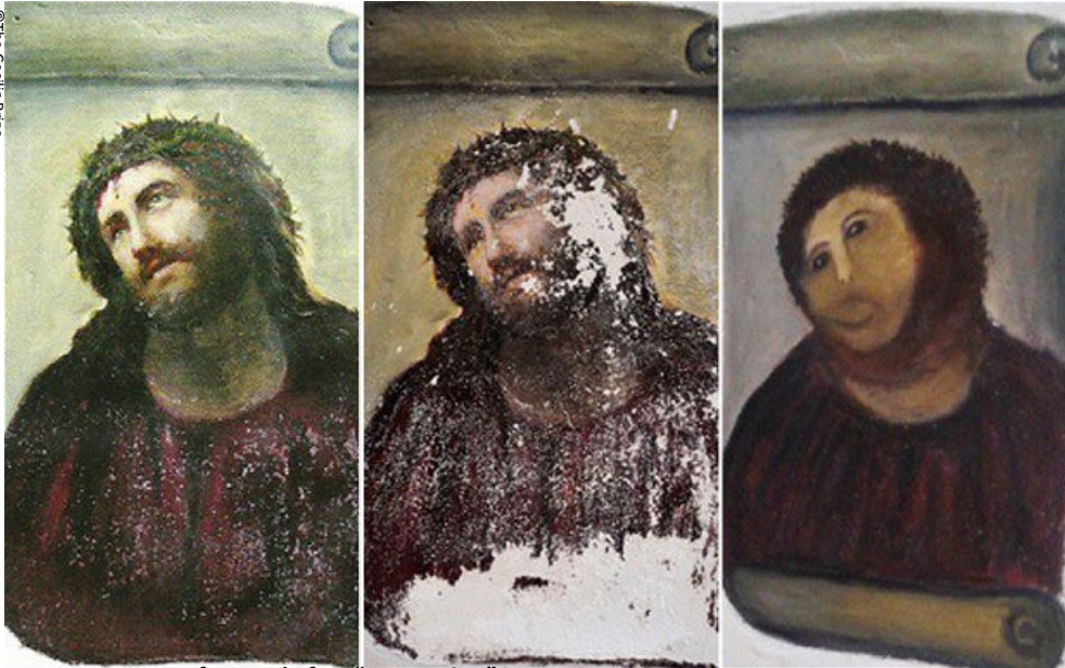
Ecce Homo – Before and after “restoration”