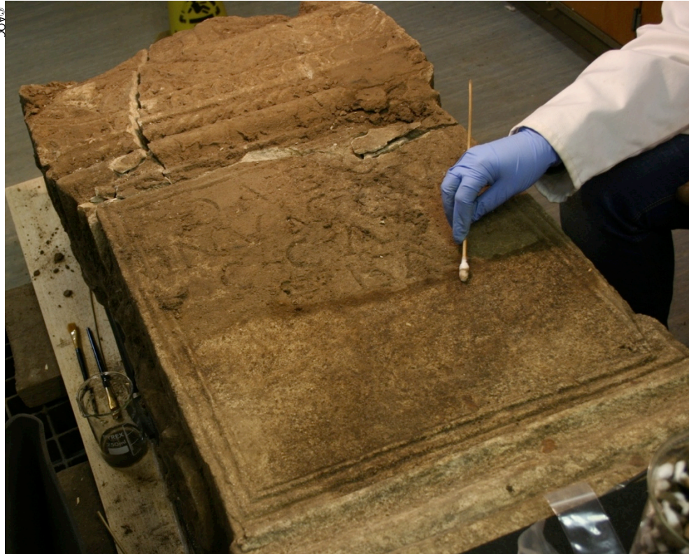
Cleaning the Mithras Altar

The altars were lifted and removed from site by a team of specialists using a small truck-mounted crane and then transported to AOC's conservation laboratory. The altars were recovered wet from the burial environment and as they dried, they were constantly monitored to ensure that they were not in danger from salt damage. Once they were fully dry the stones were turned onto their fronts. It was clear before they had been lifted off site that they had suffered from historical damage, probably due to deep ploughing methods, which had broken one of the altars into two large pieces. The second altar was very crumbly through the degradation of the natural stone binder. Great care had to be taken when turning both stones. As well as using specialist equipment, a supportive box was constructed around the stones to minimise damage during turning.