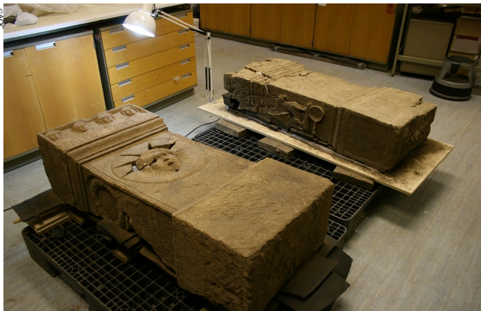
Both altars after cleaning in AOC lab

When both altars were turned over, what was discovered on the front faces of the altars was more exciting that we could have anticipated. The front face of the first altar bears a carved inscription dedicating the altar to the god Mithras. The inscription is highly significant as it is the furthest north in Britain that a dedication to Mithras has ever been found. When the second altar was turned, a panel of four busts which represent the four seasons – spring, summer, autumn and winter – was revealed.