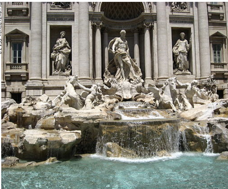
The Trevi Fountain, Rome

ROME - Several decorative pieces have detached from the Trevi Fountain, one of the best-known monument in the city of Rome, Italy. The incident raised concerns over the state of preservation of the monument, which was last restored 20 years ago.