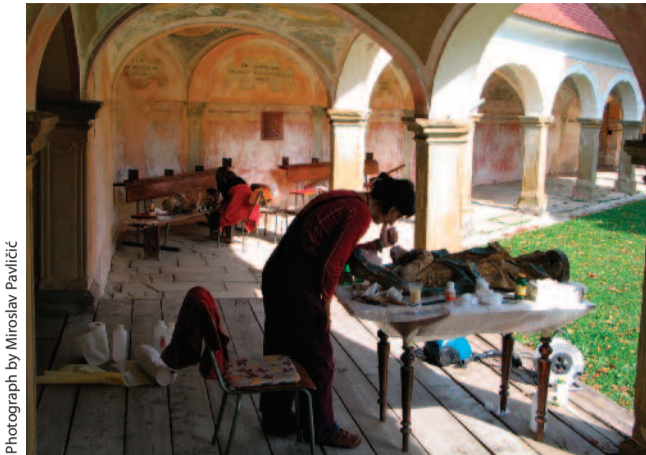
Preventive and Remedial Conservation, the Church of Saint Mary of Jerusalem at Trški Vrh, May 2006

binding of paper materials were found in the Historic Archives of Dubrovnik dating from 1449. However, the establishment of studios specialising in conservation of paper materials occurred only after WWII. The first was founded in 1954 at the History Institute of the Yugoslav Academy of Sciences and Arts in Zagreb – now the laboratory for conservation and restoration at the Croatian State Archives. This is the central laboratory for archives conservation in Croatia and specialises in paper, parchment and leather. There are smaller conservation-restoration studios for archival materials at the State archives in Pazin, Split, Rijeka, Zadar and Karlovac.