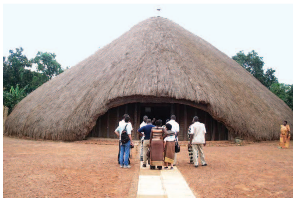
Tombs of Buganda Kings at Kasubi before the fire

UNESCO's Director-General, Irina Bokova has expressed her sorrow and called for calm: "The destruction of this site is a tragic loss for the whole world," Ms Bokova said. "I am also deeply distressed to learn that two people lost their lives in protests that followed the fire, and hope there will be a swift return to calm at this difficult time. I would like to assure the people of Uganda that UNESCO stands ready to mobilize its experts to help local authorities assess the damage and plan remedial action at Kasubi."