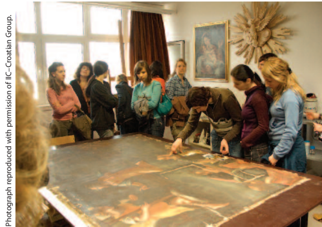
Students' conference, Split, 2006

enough financial resources, yet the need for treatments is considerable. Thus it is vital that resources are distributed to achieve the maximum benefit. Rather than aiming for complete restoration of works of art, conservators undertake regular preventive and remedial work as it is much cheaper and less time-consuming. With this approach a larger number of works of art can be protected with the same material and human resources.