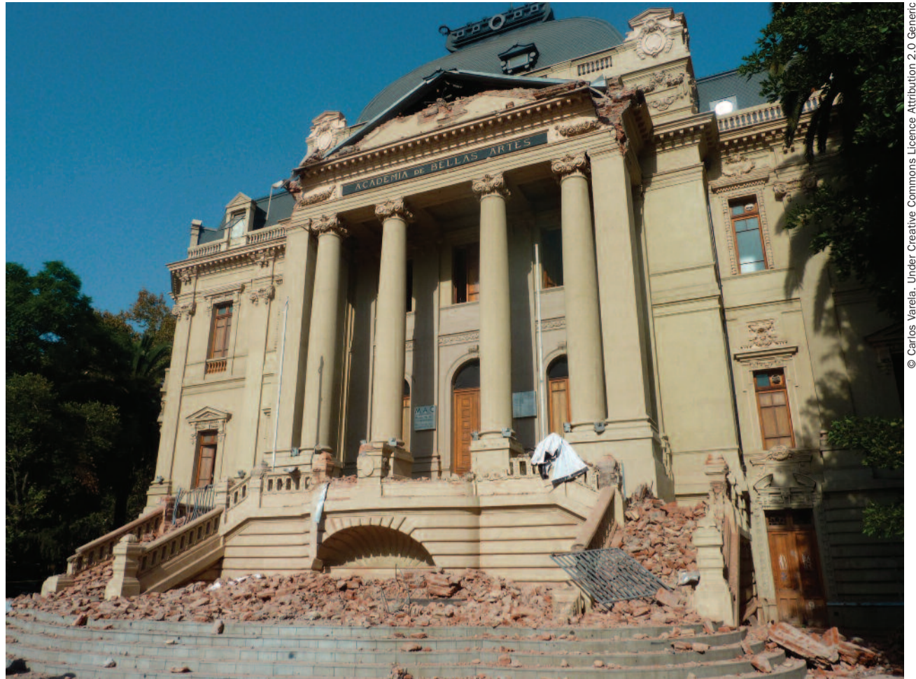
The Museum of Contemporary Art in Santiago after the earthquake.

In the meantime work continues on gathering more detail and documenting the extent of the damage. ICCROM's website summarises the media coverage of the effect of the earthquake on heritage and also provides links to local conservation organisations. ICOMOS Chile has created an interactive map for the World Heritage City of Valparaíso, in order to locate damaged buildings.