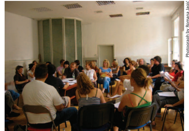
The Founding Assembly of the IIC-Croatian Group, June 2009

was founded after the reorganization of the state service. In 2007 the conservation studios of Split & Zadar, part of the Ministry of Culture, joined the Croatian Conservation Institute. In 1998, the Art Academy established conservation-restoration studies to build on accumulated knowledge and experience and to address the need for concentrated energy and skills to deal with the challenges facing Dalmatian heritage. Over the last twelve years students from the course have been involved in conservation-restoration projects in the region. For two semesters we have had 16 students in preventive conservation delivering services in museums and churches. Most of the work is focussed on over 400 art objects recently found in church lofts. This involves stabilisation, documentation, and storage solutions, monitoring and adjusting climatic conditions and providing preventive advice.